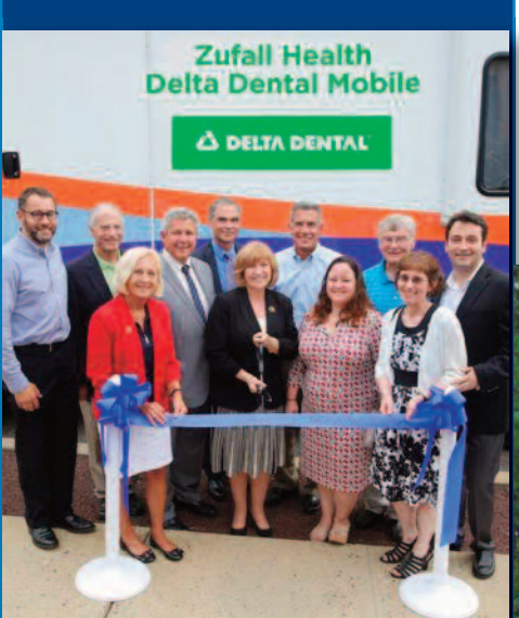
DOH Chief of Staff Gregory Myer joined Zufall Health Center on Aug. 10 for the launch of their new dental van and ribbon cutting of their newly renovated Somerville site to commemorate National Health Center Week.

For more information on New Jersey's FQHCs, visit <a href="http://www.nj.gov/health/fhs/fqhc/index.shtml">http://www.nj.gov/health/fhs/fqhc/index.shtml</a>.