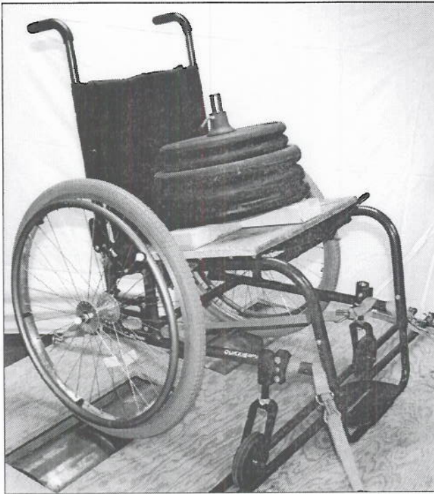
Figure 1. Test setup for solid-insert Cheng Shin tires and 377.6 N load condition.

wheel under each condition. To minimize wheelchair vibration and shifting on the dynamometer, we only used the right wheel for testing. Thus, the average load supported by the right wheel under each weight condition was 223.6 N, 291.3 N, and 377.6 N, respectively. These loads include the weight of the wheelchair, wheel, test mount, and barbell plates.