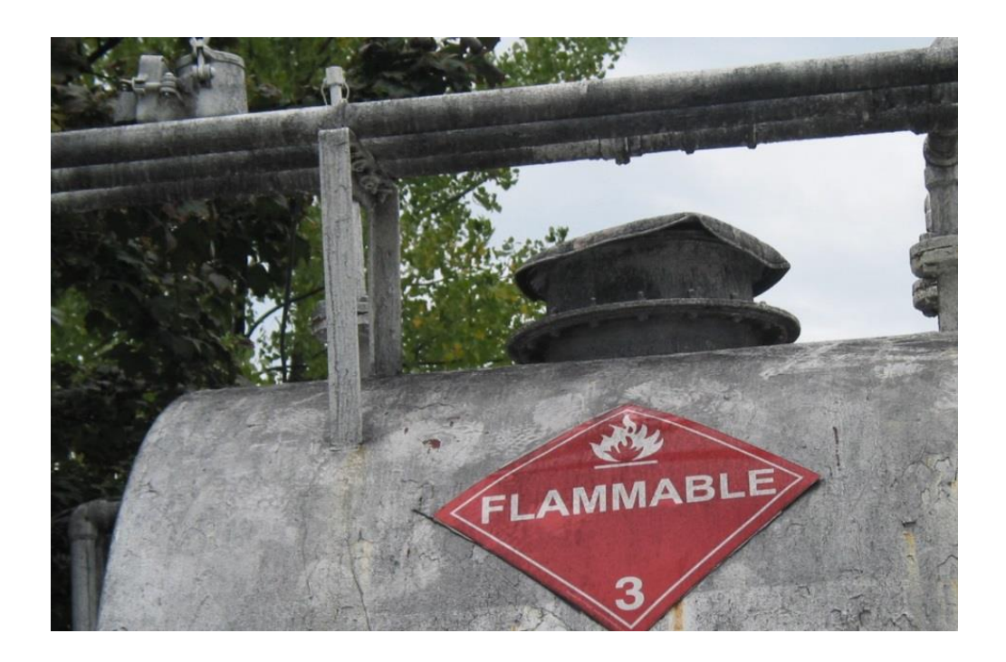
FIGURE\ 3.\ Eighty-four-inch-long\ wooden\ measuring\ stick\ used\ to\ manually\ gauge\ the\ volume\ of\ the\ remaining\ liquid\ in\ the\ tank.