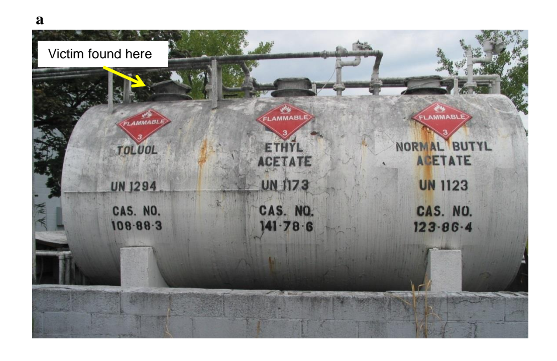
FIGURE 1: Incident site, above-ground storage tank with three 2,000-gallon sections (a. side view; b. front view).