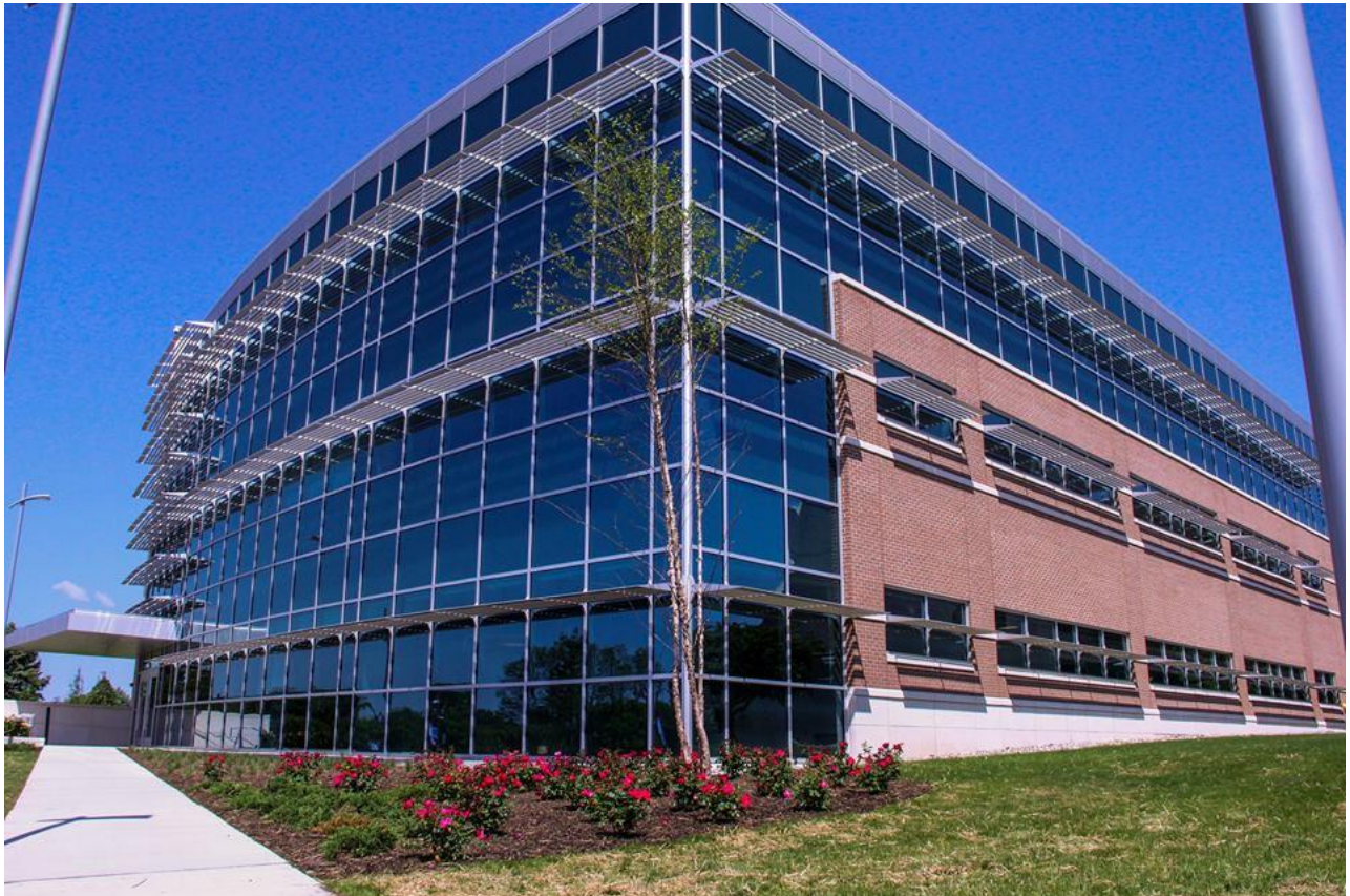
Completed Health Professions Integrated Teaching Center