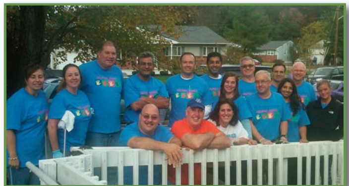
A team of volunteers from Bristol Myers-Squibb recently primed and painted a deck at Enable’s group home.

Last year, over 750 volunteers shared 5,500 hours to benefit Enable’s consumers. These men, women, and young adults provide friendly visits, plant flowers,