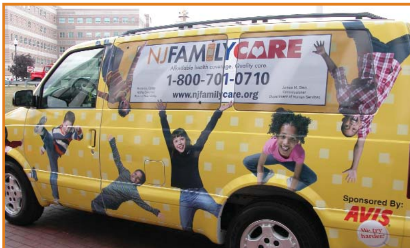
The NJFamilyCare Van (above) provides outreach to New Jersey communities, offering program and enrollment information to children and families.

Presently, more than 109,000 children are enrolled in NJFamilyCare. More than 500,000 children are enrolled in both NJFamilyCare and Medicaid.