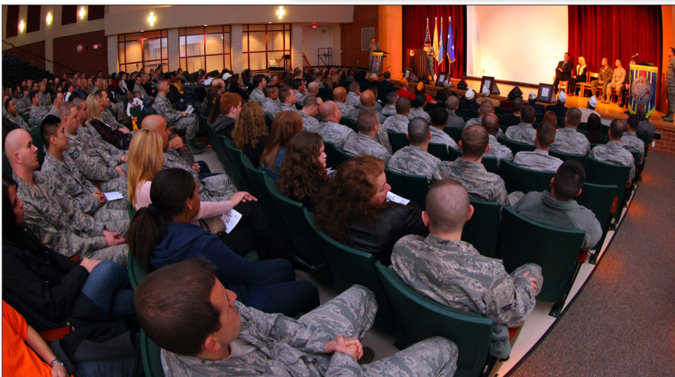
The Dr. Adam C. Pfeffer Performing Arts Center at the Cedar Creek High School in Egg Harbor City, N.J. was the site where nearly 100 Airmen from the 177th Fighter Wing were honored at a Hometown Heroes Salute on Dec. 4. The purpose of this program is to celebrate and honor the significant contributions of Airmen, their families, communities and those special supporters to the mission of the United States Air Force and the Air National Guard. The Airmen recognized in this ceremony included those who have deployed for more than 30 consecutive days in support of Operations' Enduring Freedom, Iraqi Freedom, Noble Eagle and other peacekeeping operations across the globe since 9-11 2001.