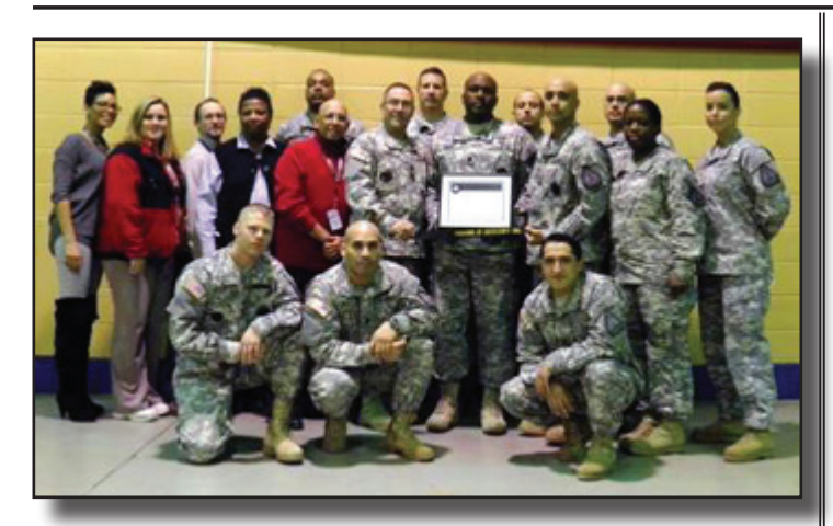
THE RSP Team accepting NGB's Accreditation Certificate and Streamer for Excellence.