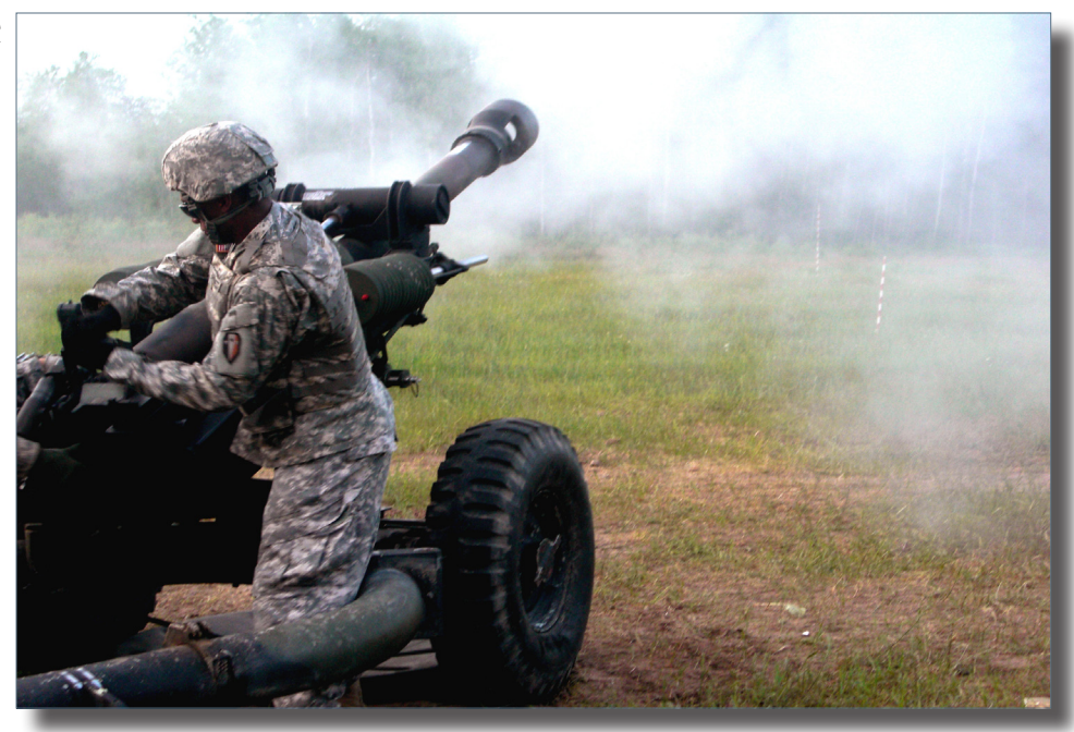
A gunner from the 3rd Battalion, 112th Field Artillery fires a 105 mm round from an M119A2 Towed Howitzer during a training exercise at Camp Grayling, Mich., from June 11 – 25. Soldiers from the New Jersey National Guard unit were able to certify their howitzer sections on the new artillery weapons.

In addition, the Soldiers are extremely excited to field the new howitzers and to be back in the artillery operations.