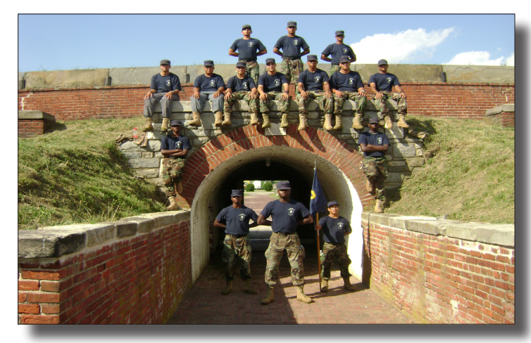
Cadets from the New Jersey Youth ChalleNGe Academy proudly wear recently donated BDU pants during one of their community service outings at Fort Mifflin on the Delaware, Pa. The BDUs were donated to the NJYCA by several organizations and military service members.