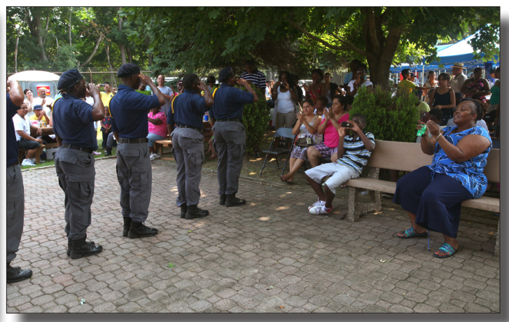
Family members of Cadets from the New Jersey Youth ChalleNGe Academy take photographs of their loved ones during the family picnic event held at the Lawrenceville campus of the New Jersey Department of Military and Veterans Affairs.