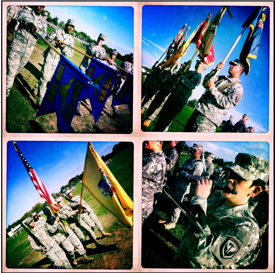
Clockwise from top left: guidon bearers of the 108th Wing; guidon bearers of the 50th Infantry Brigade Combat Team; Soldiers and Airmen of the New Jersey National Guard Honor Guards; and Soldiers of the 63rd Army Band practice prior to the New Jersey National Guard's annual Military Review at the National Guard Training Center at Sea Girt, N.J. Sept. 30.

Gov. Chris Christie, the Commander in Chief for the New Jersey National Guard, spoke about the grandeur and the cost of the hard-won peace of mind earned by America's fighting women and men. Before the ceremony, Christie joined the wife and young daughter of a deployed Soldier in a teleconference with the officer from his base in Afghanistan.