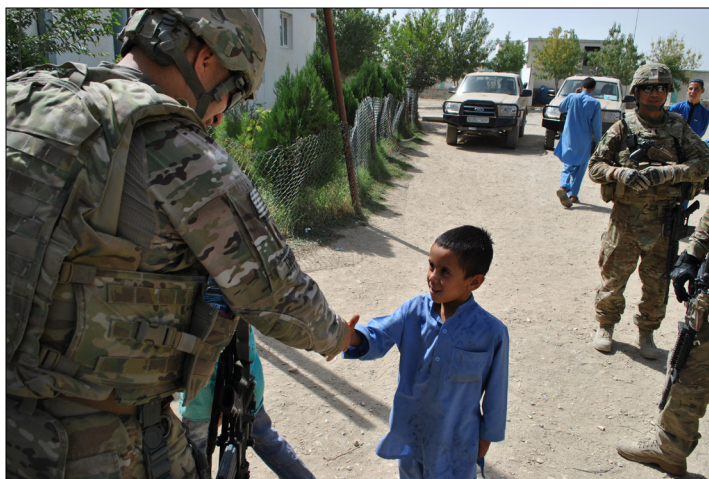
A New Jersey National Guard Soldier shakes hands with an Afghan student at a local village where they assisted with the school project. The Soldiers are part of the Military Advisory Team helping the Afghan National Army.

“We've made a lot of progress,” he said.