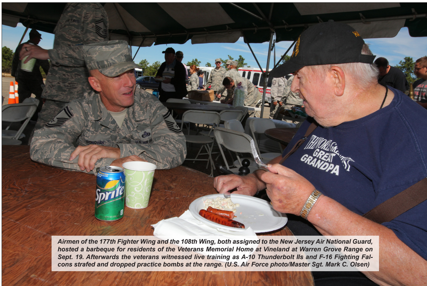
Airmen of the 177th Fighter Wing and the 108th Wing, both assigned to the New Jersey Air National Guard, hosted a barbeque for residents of the Veterans Memorial Home at Vineland at Warren Grove Range on Sept. 19. Afterwards the veterans witnessed live training as A-10 Thunderbolt IIs and F-16 Fighting Falcons strafed and dropped practice bombs at the range.