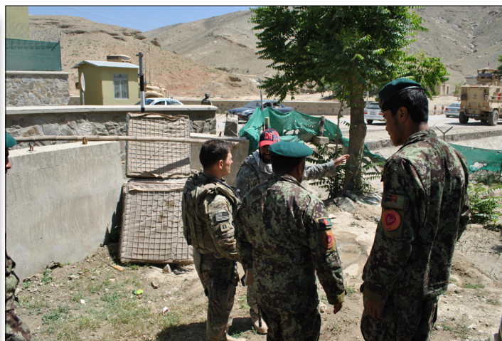
The Military Advisory Team, which consists of New Jersey National Guard Soldiers and Albanian Defense Forces, discuss upgrades to the local village with a member of the Afghan National Army.