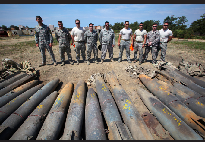
The 177th Fighter Wing Explosive Ordnance Disposal (EOD) unit held their annual clearance operation at Detachment 1, Warren Grove Range May 29 to June 1, 2012. To view more photos of the EOD unit at work, please visit and like our Facebook page at New Jersey National Guard.