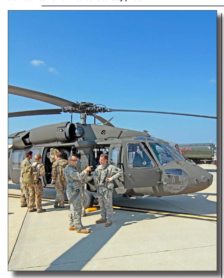
Members of the 227th Air Support Operations Squadron, 177th Fighter Wing, New Jersey Air National Guard, prepare for a training mission in conjunction with the 1-150th Assault Helicopter Battalion at the 177th Fighter Wing, Egg Harbor Township, Aug. 8.