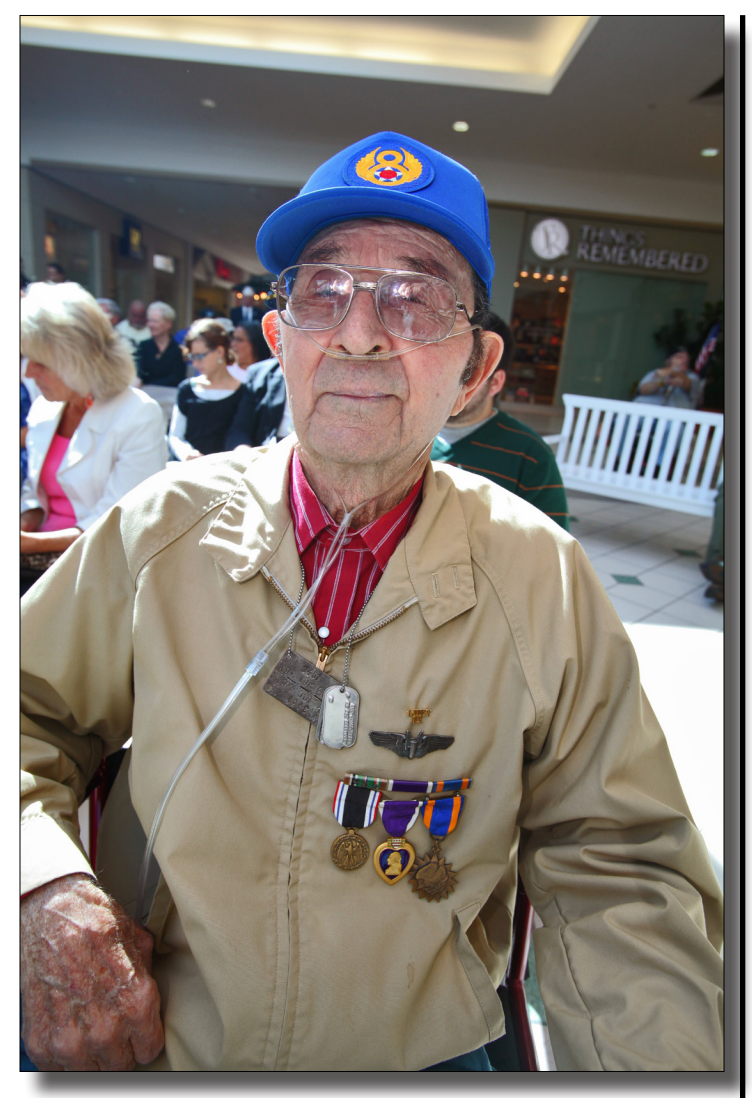
Photo above, a World War II veteran proudly display his service medals at the medal ceremony at Cumberland Mall Sept. 25. Photo below, Volunteers help unload the more than 40 dormitory-style refrigerators donated by the Veterans Support Organization to the Veterans Transitional Housing Program - Veterans Haven South located in Winslow Township Sept. 26. To see more photos from both of these events, please visit our <u>NJ DMAVA</u> Facebook page.