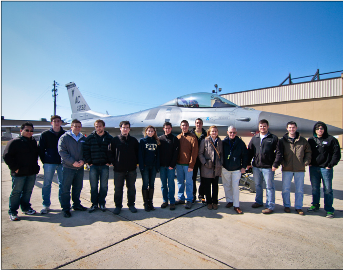
Aeronautical engineering students from Lehigh University stand in front of a 177th Fighter Wing F-16C Fighting Falcon during a base tour on April 3, 2013.