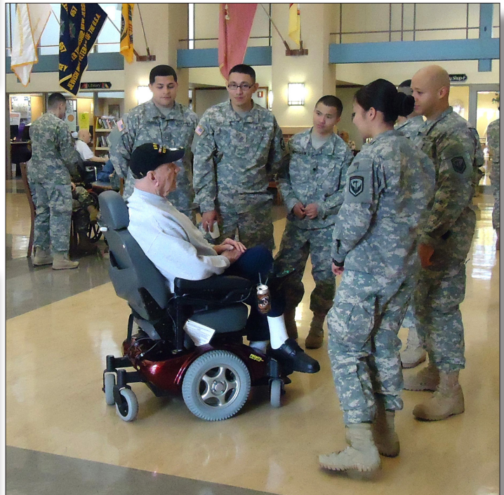
Citizen-Soldiers from the 42nd Regional Support Group, New Jersey National Guard, visits the Menlo Park Veterans Memorial Home April 7, 2013. The Guard members brought vehicles from the Somerset armory and spent time with the veterans in the home's town square.