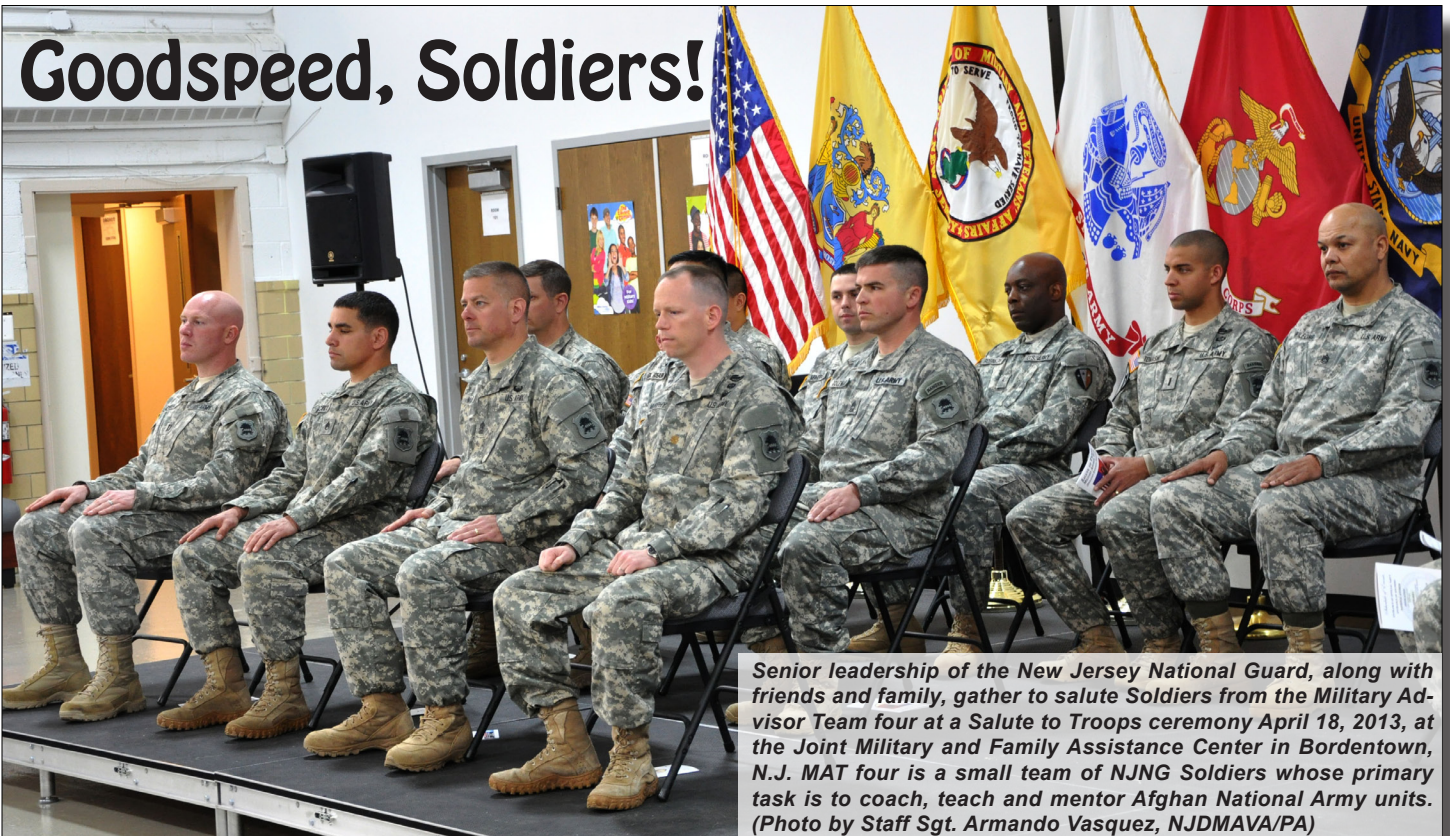
Senior leadership of the New Jersey National Guard, along with friends and family, gather to salute Soldiers from the Military Advisor Team four at a Salute to Troops ceremony April 18, 2013, at the Joint Military and Family Assistance Center in Bordentown, N.J. MAT four is a small team of NJNG Soldiers whose primary task is to coach, teach and mentor Afghan National Army units.