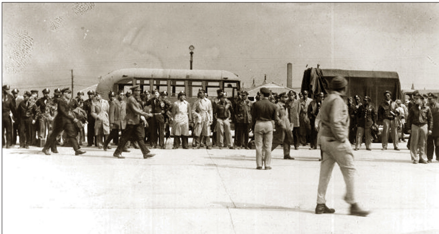
African-American officers of the 477th Bombardment Group at Freeman Field, Ind., prepare to board air transports to take them to Godman Field, Ky., for refusing to sign a document acknowledging that they had read a regulation denying them access to the all-white officers' club. The photo was probably taken by Master Sgt. Harold J. Beaulieu Sr., who hid a camera in a shoebox. A similar photo taken by Beaulieu appeared in the Pittsburgh Courier. Photos taken at the scene by another African-American photographer were reportedly destroyed by a white officer.

On April 5, two groups of black officers attempted to enter the