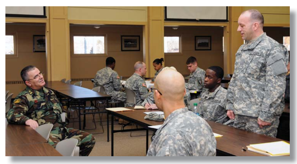
Brig. Gen. Hoxha talks with Soldiers from the current officer candidates at the National Guard Training Center.

The SPP supports U.S. national interests and security cooperation goals by engaging partner nations via military, socio-political and economic conduits at the local, state and national level.