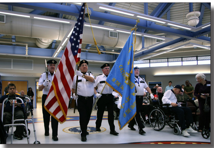
Color Guards from Fr Washington Post 1710, Catholic War Veterans of the United States of America, Inc., post the colors at the Veterans Day celebration at the New Jersey Veterans Memorial Home at Paramus Nov. 12, 2013. Following the Veterans Day ceremony, a 6-by-10-foot acrylic mural named "Lest We Forget" was unveiled at the front lobby of the Home.