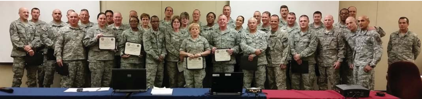
Thirty-nine New Jersey National Guard Soldiers and Airmen attended the National Guard Technician Personnel Management Course at the Joint Training and Training Development Center at Joint Base McGuire-Dix-Lakehurst, N.J., Oct. 23, 2014. The course provides in-depth instruction on all aspects of supervisory responsibility of full