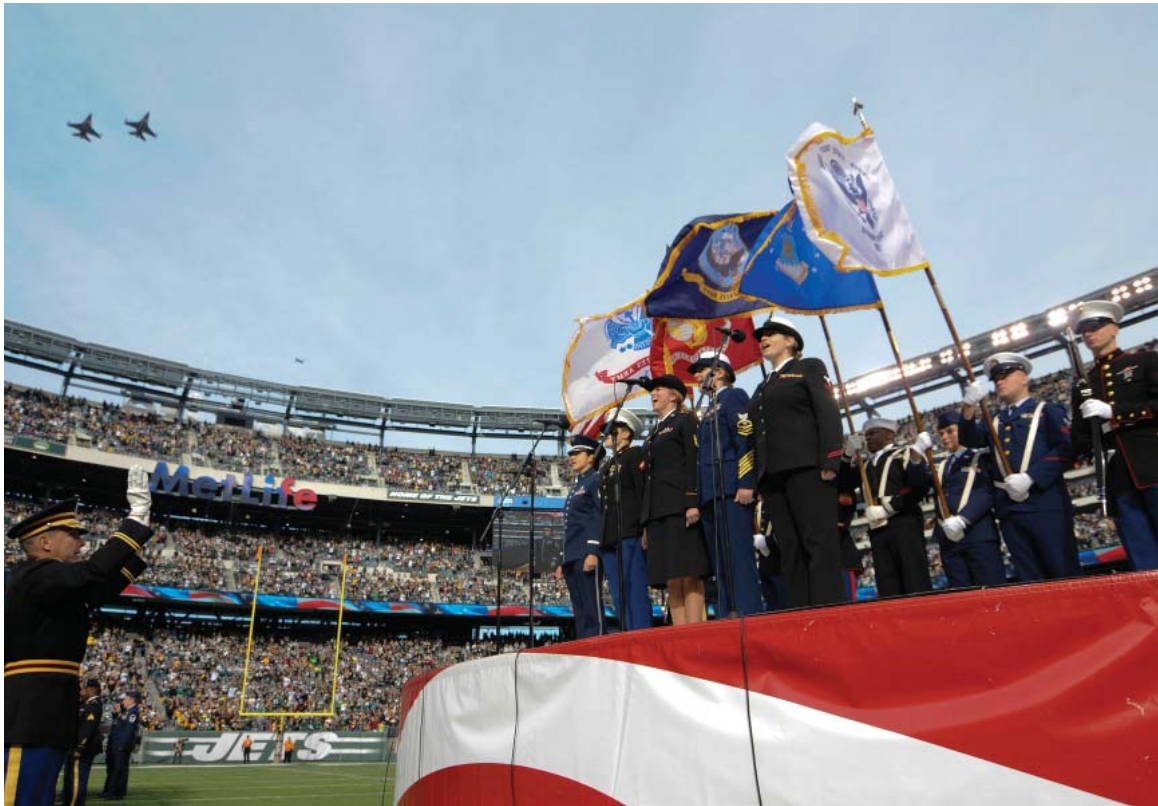
Photo left: F-16 Fighting Falcons from the 177th Fighter Wing fly overhead as service-members from each branch of the military sing the National Anthem at MetLife Stadium on Nov. 9, 2014. The National Football League honored military members as part of their Salute to Service event. Photo below: Soldiers from the New Jersey Army National Guard's 50th Infantry Brigade Combat Team participated in the pre-game ceremonies at MetLife Stadium in East Rutherford, N.J., Nov. 9, 2014.