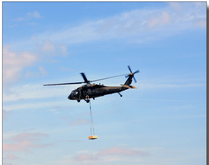
A 1-150th Aviation's UH-60 Blackhawk conducts hoisting and sling loading operations May 16, 2014 at Joint Base Cape Cod.