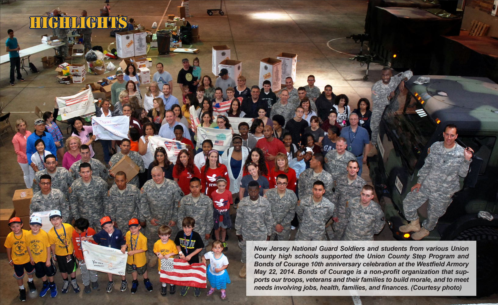
New Jersey National Guard Soldiers and students from various Union County high schools supported the Union County Step Program and Bonds of Courage 10th anniversary celebration at the Westfield Armory May 22, 2014. Bonds of Courage is a non-profit organization that supports our troops, veterans and their families to build morale, and to meet needs involving jobs, health, families, and finances.