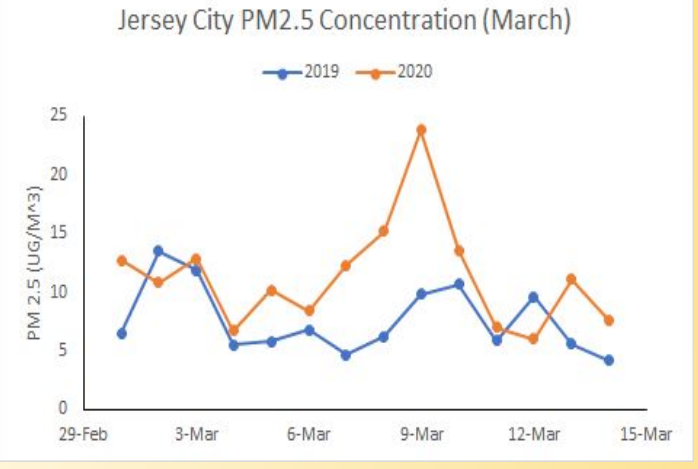
Graph of PM 2.5 concentration in Jersey City using AirNow data from the U.S. Environmental Protection Agency (EPA).

In addition to New Jersey's reporting, NASA has taken satellite images and measurements of nitrogen dioxide (NO_2) , another common tailpipe emission, over the