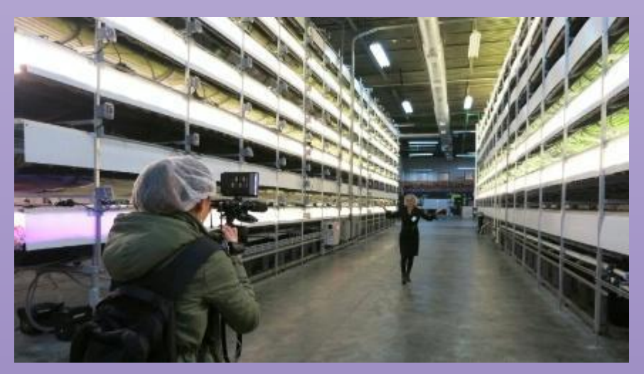
An AeroFarms vertical farming facility.

As vertical farming becomes more widespread, hopefully this sustainable option will become increasingly available and affordable to consumers looking to reduce their carbon footprint through the food they consume.