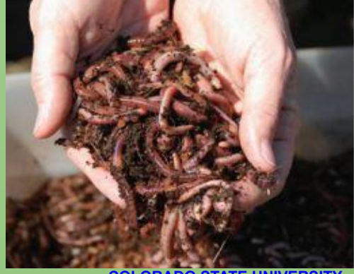
OLORADO STATE UNIVERSITY

The U.S. EPA estimates that 55-65% of the waste generated in the United States is from the residential sector, i.e. our homes. Most of what we throw away is organic waste, and that all has the potential to be vermicomposted. And think about it: other institutions such as schools, office buildings, stores/restaurants produce significant amount of organic wastes. If the right infrastructure was created to collect and process this waste, vermicomposting could become an integral part of the sustainable solution to our solid waste management challenge.