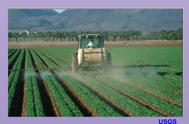
Pesticides are applied to a field of crops.

Agrochemicals are used because they assist in increasing plant crop yield, resulting in more abundant harvests that increase the revenue of farmers and feed more people. However, excessive use of agrochemicals can cause contamination of groundwater and drinking water wells with chemical byproducts that are toxic to humans and animals. When runoff containing agrochemicals flows into water bodies, the aquatic ecosystem is disrupted. This can lead to negative impacts including harmful algal blooms and oceanic dead zones.