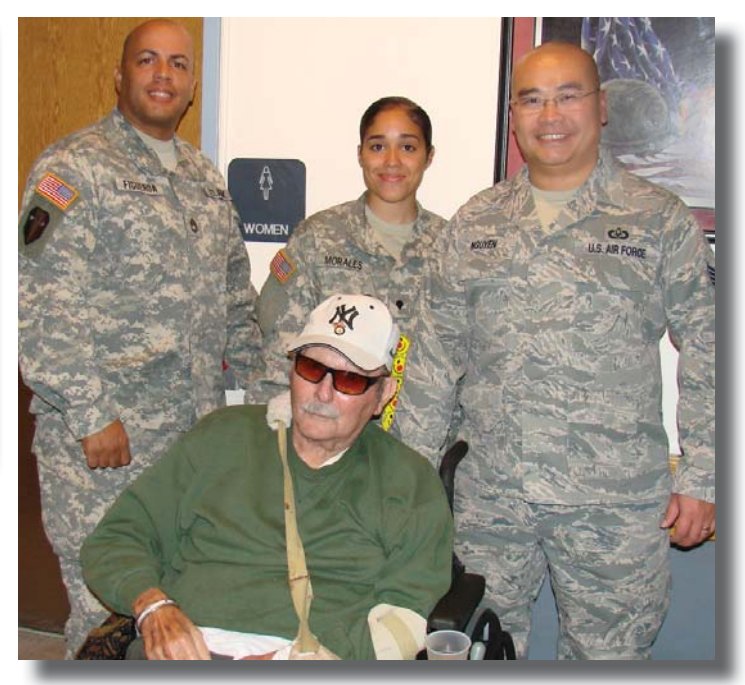
Soldiers, Airmen visit homes

Volunteers give homeless veterans haircuts during Stand Down 2010 at the Army National Guard Armory in Cherry Hill on Sept. 25, 2010. Stand Downs are designed to provide homeless veterans and their family members with access to healthcare, medical screening, veterans' benefits counseling, substance abuse counseling, legal and employment services, social services, vocational rehabilitation services, a hot meal, a haircut, and winter clothing. A Stand Down was also held on Oct. 16, 2010 at the John F. Kennedy Pool and Recreation Center in Newark. Homeless Veterans or their families can call 1-888-8NJ VETS for information on entitlements.