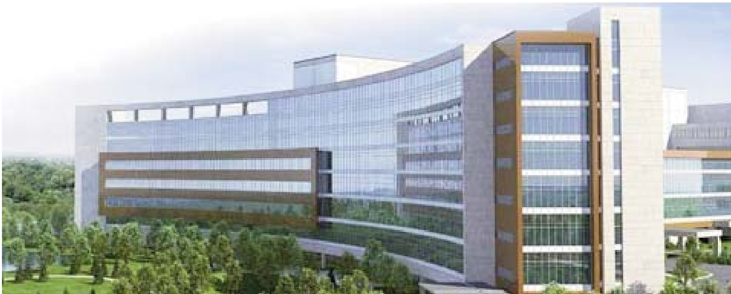
Rendering of Virtua's new hospital in Voorhees

Privately placed with Bank of America, NA, the bonds constitute parity obligations secured by mortgaged property and gross receipts of the hospital for the equal benefit of the holders of the remaining Series 1997, Series 2006 and Series 2008 Bonds. In addition, the term sheet gives the bank the right to put the bonds in five years. The bonds have a final maturity date of July 1, 2036.