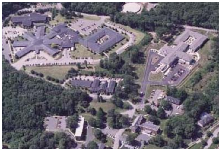
Aerial view of CHCC's vast campus