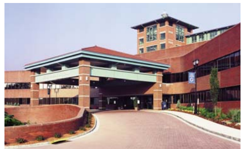
Holy Name Hospital exterior

The short-term market had been extremely unstable prior to the closing. Interest on seven-day variable rate bonds increased dramatically; the SIFMA index jumped from 1.79% on September 10th to 7.9% on September 24th. The Federal Government proposed a plan to help restore rates to their historic levels, though there was no assurance as to how long that would take. Holy Name decided to proceed with the financing and the mid-November issue received an all-in true interest cost of 5.20%.