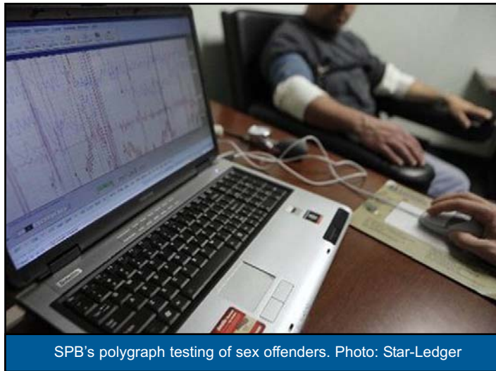
SPB's polygraph testing of sex offenders.

ed to the State Parole Board, matched by $16,667 in state funds. In November 2009 the State Parole Board released a study that reviewed the cases of 595 sex offenders under the agency's supervision, 40 percent of whom had been subject to at least one polygraph examination. The report found polygraph testing to be an invaluable resource for sex offender supervision and treatment. The State Parole Board's use of polygraph testing has garnered nationwide support. Kim English, a nationally respected researcher and author on sex offender supervision matters with the Colorado Division of Criminal Justice, noted in