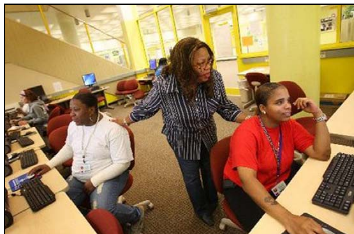
FORGE program at Essex County College.

Female Offender Reentry Group Effort (FORGE): As noted above, research released in October 2009 has found FORGE and its PACT support group are associated with significant reductions in the re-arrest rates of female ex-offenders in Essex County. FORGE began with a New Jersey parole officer’s observations about the unique risks and needs faced by the female