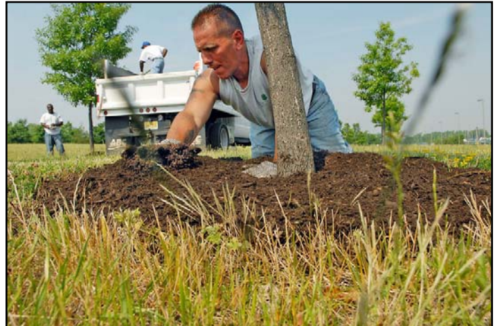
Partnerships for employment and job training.

Greater Mercer Prisoner Reentry Initiative (Greater Mercer PRI): The State Parole Board joined with the Trenton Mayor's Office of Employment and Training (MOET), Department of Corrections and a private provider Opportunities