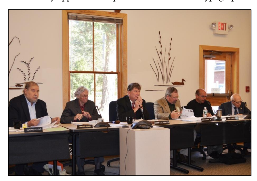
The Commission adopted several amendments to the Pinelands Comprehensive Management Plan in 2014.

More specifically, the amendments serve to codify current Commission practice, clarify existing standards and requirements, increase the efficiency of the Commission and its staff, eliminate unnecessary application requirements and correct typographical errors in the regulations. The