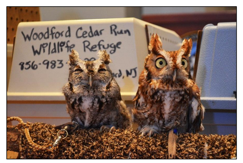
The 25<sup>th</sup> annual Pinelands Short Course featured 36 presentations, including one on owls of New Jersey (shown above).

A total of 400 people attended the Short Course. The event included 20 new programs, including presentations on southern pine beetles, the Jersey Devil, dragonflies and damselflies, butterflies and moths of the Pinelands, native bees and other Pinelands insects, wildlife habitat restoration, owls of New Jersey, the Pine Barrens Byway, the Kirkwood-Cohansey Aquifer system, stream health, the Batsto Village, the Bass River State Forest and the Mullica River.