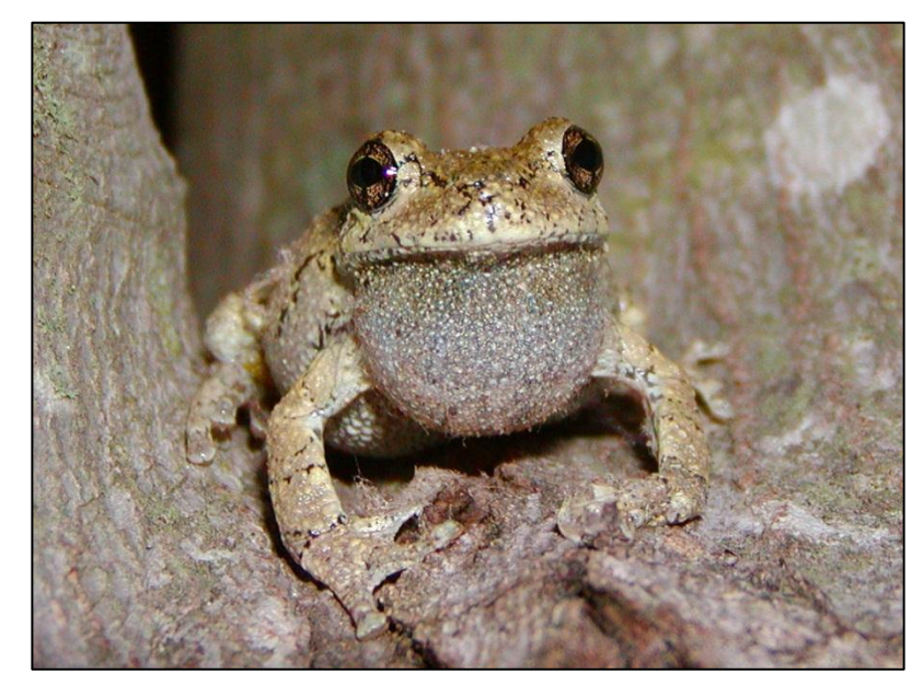
Some stormwater basins can provide breeding habitat for the endangered southern gray treefrog.

Like natural wetlands, created wetlands can provide the habitat necessary for wetland-dependent plants and animals, especially in human-dominated landscapes where natural wetlands may have been degraded or eliminated. As part of another study, Commission scientists mapped the location of two types of created wetlands commonly found in the Pinelands, shallow excavations that intercept the groundwater (excavated ponds) and excavations designed to receive stormwater (stormwater basins). About 2.000 excavated ponds and 1,700 stormwater