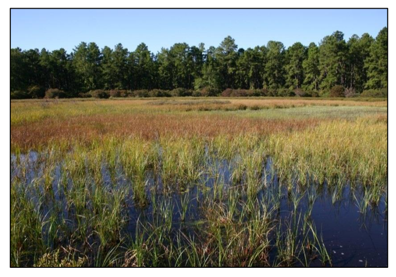
Natural ponds, such as this one in Brendan Byrne State Forest, provide habitat for many species of Pinelands plants and animals.

Commission scientists continued to make progress on a study to characterize the vulnerability of Pinelands ponds to surrounding land uses. Scientists began the first phase