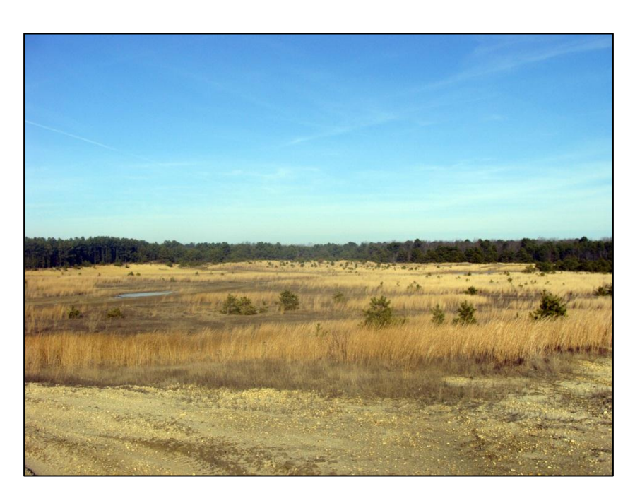
In 2014, the Commission permanently preserved a 195-acre property (above) in Jackson, Manchester and Toms River townships.

The property features exceptional natural resources, including 1,500 linear feet of