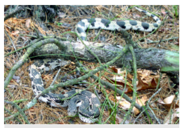
Along with areas of sparse vegetation cover preferred for nesting and denning, the northern pine snake (Pituophis m. melanoluecus) uses relatively large tracts of forest as part of its activity range.

Preliminary methods have been developed to evaluate landscape, aquatic, and wetland integrity based on land-use/land-cover spatial data. The landscape integrity assessment will rank over 32 million landscape units (each landscape unit is 100 square-meters), and over 7,000 drainage-basin units will be examined in the aquatic and wetlands assessments. The three integrity ranks will be used to develop a composite ecological-integrity score for each landscape unit and prepare an ecological-integrity map of the Pinelands. All of the integrity analyses are being conducted using Geographic Information Systems (GIS)