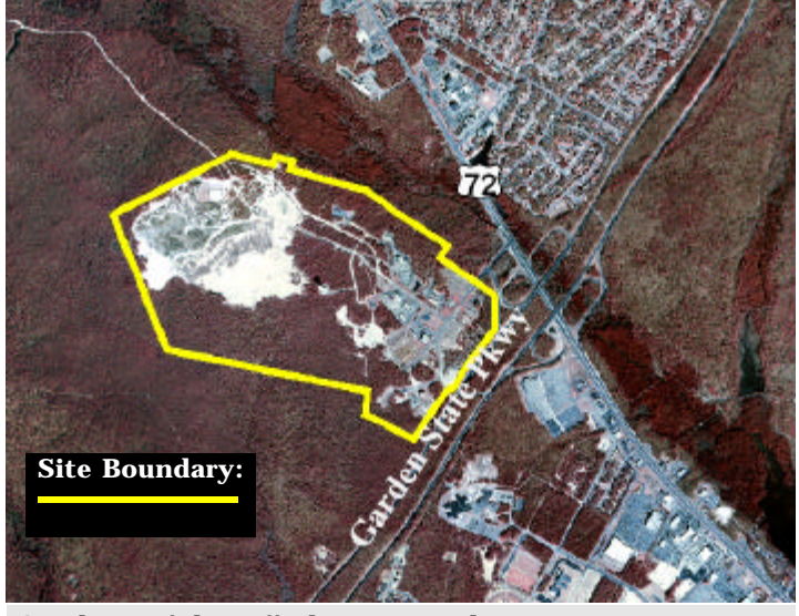
Aerial Map of the Stafford Business Park

ELimiting the amount of acreage on the capped landfill to be utilized for the relocation of Ocean County's leaf composting facility to 20 acres;