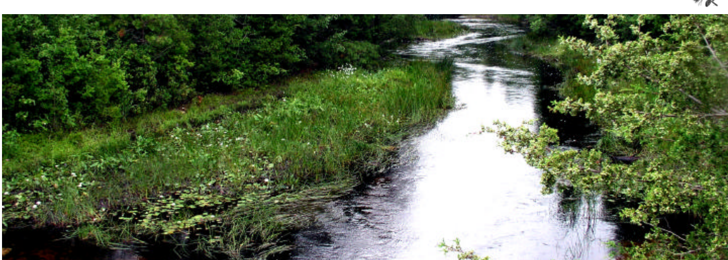
Vegetation lines the tea-colored water of the Cedar Creek, which meanders through the historic Double Trouble State Park in the Pinelands.