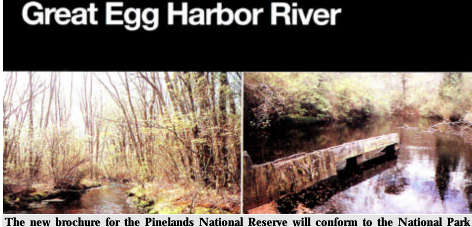
The new brochure for the Pinelands National Reserve will conform to the National Park Services' (NPS) "Unigrid System," a layout and design format that has been used for all NPS brochures since 1977, including the brochure for the Great Egg Harbor River (shown above).

The project began in early 2006 and could be completed during the summer of 2007.