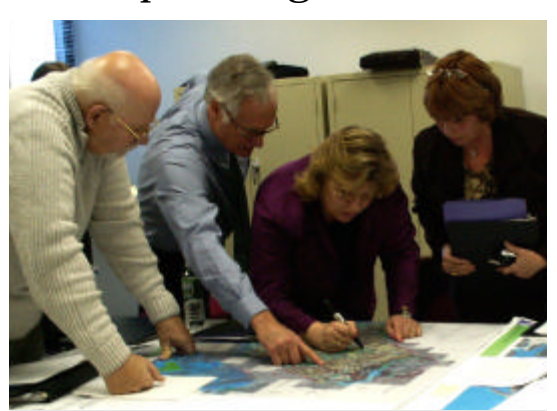
Members of the Egg Harbor Township visioning team discuss community design strategies during a meeting in March.

Between March 7th and April 18th, the consultants held several meetings with the Visioning Team to explore each of the four major topic areas in detail. At the conclusion of the meetings, the consultants began developing initial strategies to respond to issues identified by the community. In mid-May a second public meeting was held to present these planning concepts to the Township residents. A third public meeting