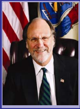
Jon S. Corzine Governor

A Publication of the New Jersey Division of Rate Counsel