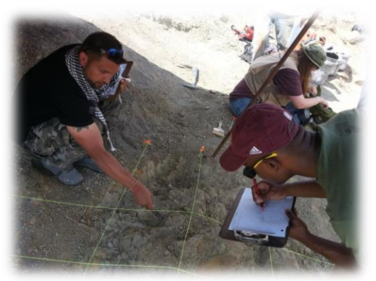
Students mapping a Pachycephalosaurus quarry in 2014 in northern Wyoming.