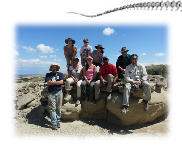
Members of the 2014 Paleontology Field Camp team in northern Wyoming.