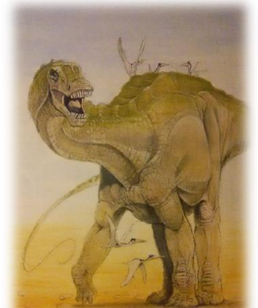
Suuwassea emilieae. Artwork by Jason C. Poole

Finally, we will be collecting Devonian-age (416 – 360 million years ago) marine animals, such as primitive fish and arthropods, and the earliest land plants, at our newest and perhaps most scenic field site – Beartooth Butte, in northern Wyoming.