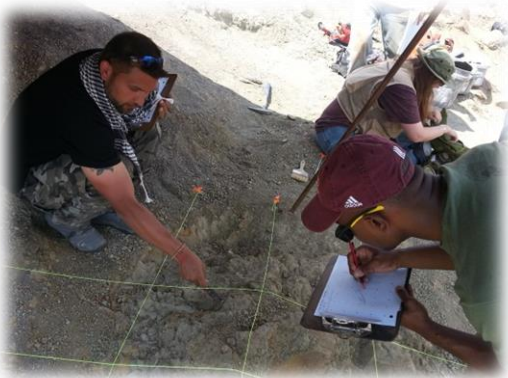
Students mapping a Leptoceratops quarry in 2014 in northern Wyoming.