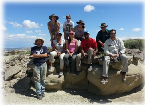
Members of the 2014 Field Expedition team in northern Wyoming.