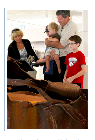
"I brought my children here to explain what happened to America that day. When they grow up I hope that they'll bring their children here too."

In the months leading up to the 10th anniversary of the September 11 terrorist attacks, the staff of the New Jersey State Museum began conceptualizing plans to commemorate the "Day that Changed America." A small display of State Museum artifacts in the Rotunda of the State House soon evolved