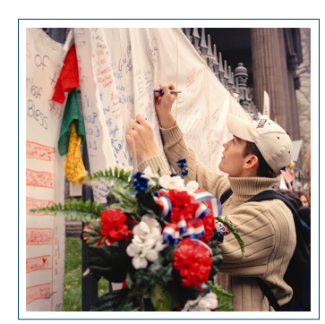
Memorial, St. Paul's Chapel, Broadway, New York, 2001

Please share feedback on your experience in implementing the lessons in your classroom by completing the Museum's program evaluation survey (enclosed in this packet) and available via email upon request.