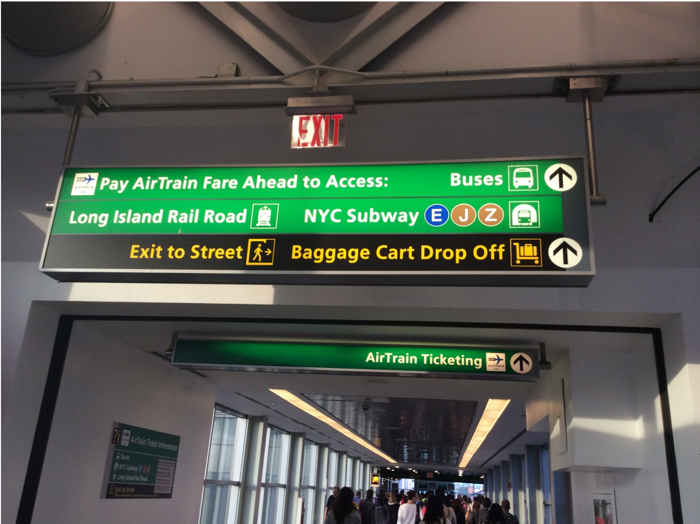
Look for these self-serve machines and pay your fare: