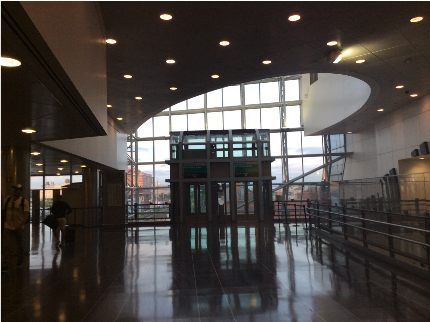
Follow the signs to the Long Island Railroad: