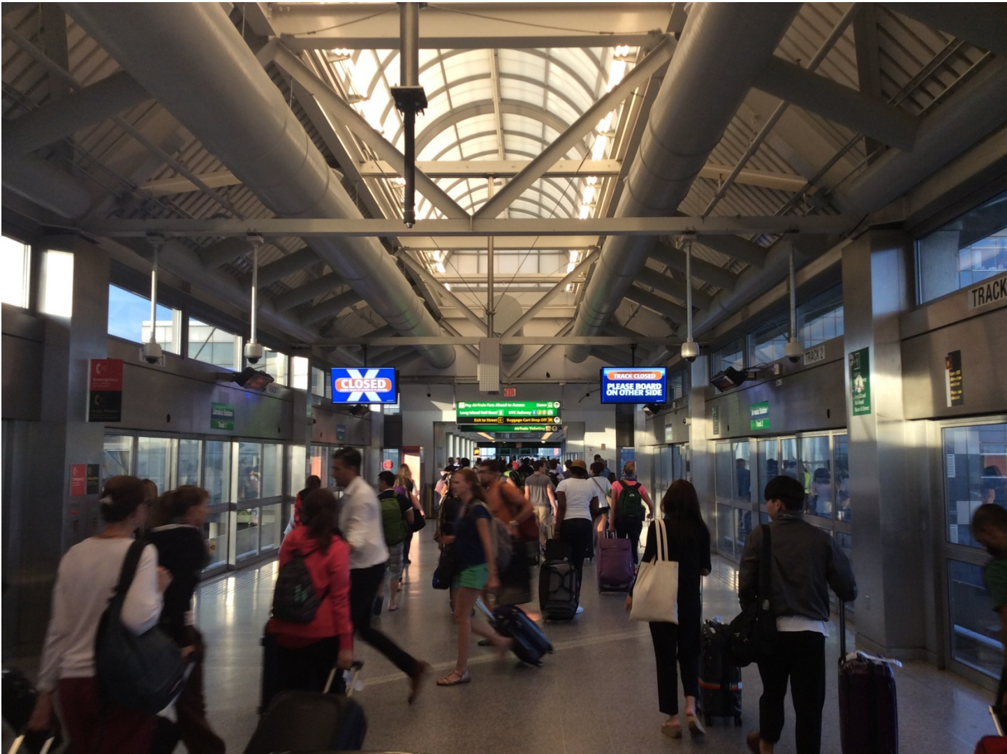
Follow the signs to “AirTrain Ticketing” and move towards the Long Island Railroad (LIRR).