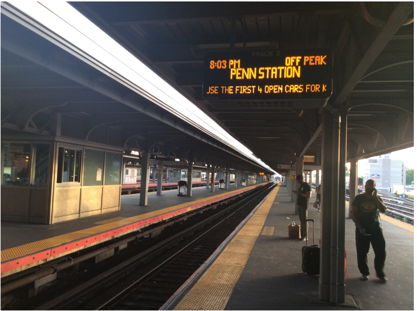
Once the train arrives, board the train: