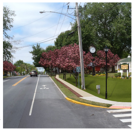
DAGSBORO STREETSCAPE IMPROVEMENTS-DAGSBORO,DE

for Transportation Enhancements contracts for more than 10 years. Services provided under these contracts have included sidewalk enhancements; design of ADA-compliant curb ramps and sidewalks; corridor projects that include upgrades such as increased lighting, traffic signal enhancements, and bulb-outs for