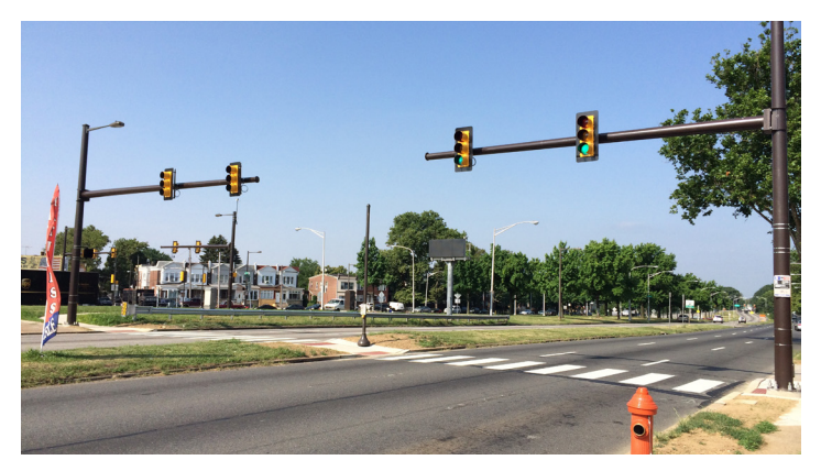
2ND AND ROOSEVELT, PHILADELPHIA, PA

On numerous state and county projects, McCormick Taylor was the lead designer on ADA curb ramp designs and obtaining approval from the Districts. In addition, McCormick Taylor reviews ADA designs in and is also responsible for field inspection of the completed ramps.