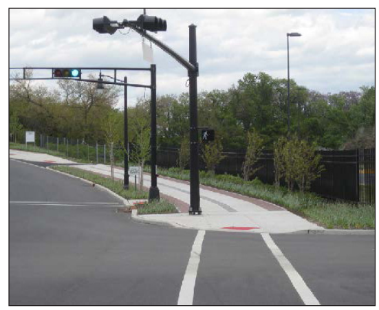
CAMDEN CENTRAL GATEWAY

and CCMUA. It also entailed the incorporation of an ADA-compliant multi-use bicycle/pedestrian trail, which is part of the Camden Greenway Project. The greenway trail incorporated Context Sensitive Design solutions such as ornamental lighting, stamped concrete, greenway signage, brick pavers, and street trees where ROW was available. SRTS elements such as ADA compliant curb ramps and high visibility crosswalks were provided at 23 intersections in the project area to enhance safety for children accessing the Forest Hill Elementary School and Camden High School. A Categorical Exclusion Document (CED) was prepared and secured in accordance with the FHWA NEPA process. McCormick Taylor was responsible for preparation and submission of a Concept Development/ Feasibility Assessment Report as well as full Preliminary Design, Final Design and PS&E packages.