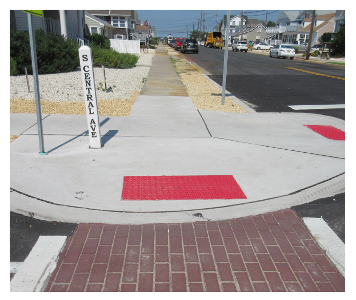
ROUTE 35 PAVEMENT RECONSTRUCTION

McCormick Taylor provided final design and construction engineering services to reconstruct a 4-mile corridor of Route 35 subsequent to Superstorm Sandy. The project included pavement reconstruction; drainage upgrades including pump stations, drainage pipes, inlets and bicycle-safe grates; traffic signal replacement including high-visibility crosswalks, pedestrian pushbuttons and pedestrian countdown signal heads; installation of a pedestrian hybrid beacon (HAWK signal) and mid-block pedestrian crossings with high-visibility crosswalks and pedestrian safety signage; implementation of an exclusive bicycle lane and associated signage/pavement markings along Route 35; design of more than 400 ADA-compliant curb ramps and detectable warning surfaces; reconfiguration of on-street parking; sidewalk and crosswalk improvements; and signing upgrades.