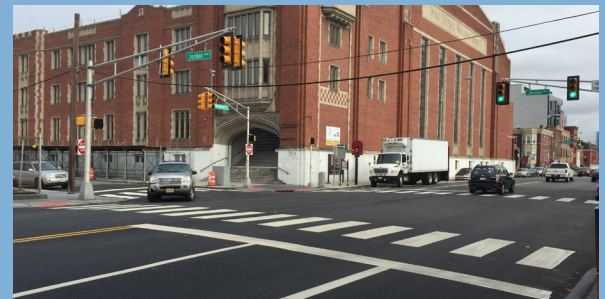
Before/after comparison of a local safety intersection improvement project in Jersey City, implemented with the help of WSP|PB local design assistance services