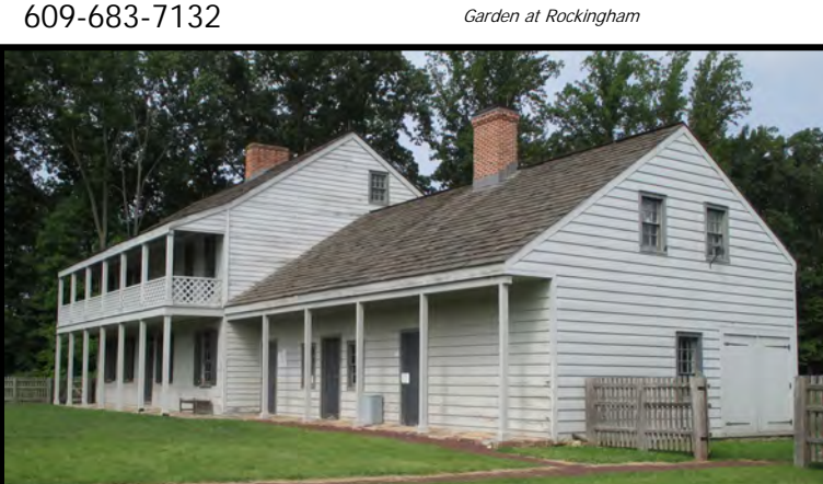
General Washington's headquarters at Rockingham