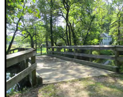
fish, and bird watch; over 160 bird species have been spotted within the byway corridor. Check the D&R