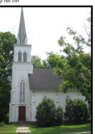
Rocky Hill Today Rocky Hill is a

19th-century village, where visitors can see many architectural styles, including Federal, Greek Revival, Second Empire, Queen Anne, Carpenter Gothic, Italianate, and Bungalow. Travelers in 1748 called it Rockhill, because it was covered with rocks so big it took three men to roll them! www.Rockyhill-nj.gov