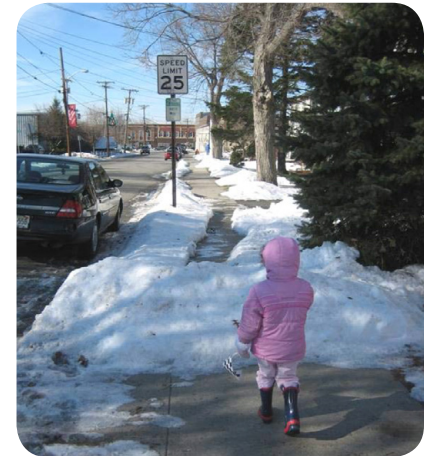
Snow blocks the child's path.

While snow and ice removal is typically the responsibility of the abutting property owner in New Jersey, municipalities should consider taking on snow removal responsibility along identified routes to school. Municipalities should also inform residents of any designated school routes and give priority to helping those who need assistance with snow removal or other sidewalk repairs, such as elderly or disabled residents.