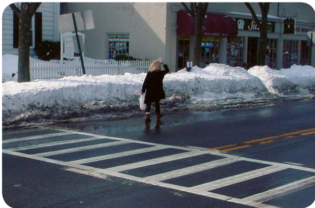
A pedestrian is stranded in the street by snow blocking the midblock crosswalk.

Many local governments require property owners to remove snow/ice from an abutting sidewalk after a winter storm. The laws regarding snow and ice rules and regulations vary across the state. Municipalities may have different time limits on how long sidewalks can remain covered and where the snow can and cannot be shoveled. Often these ordinances and/or maintenance plans do not fully address the need to clear snow from other adjacent pedestrian facilities, such as curb ramps, crosswalks, pedestrian islands/medians, transit stops/shelters, walkways on bridges, and year-round trail systems. In addition, higher mounds of snow frequently develop at street intersections, blocking crosswalks and reducing intersection sight distance.