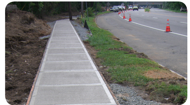
New sidewalk.

According to the RSIS, sidewalks shall be provided on both sides of the street when the minimum lot size in the development is smaller than two acres and the development is located within two miles of a school, regardless of road classification (N.J.C.A. 5:21-4.5). Since there is no comparable set of statewide standards establishing requirements for nonresidential developments, the circulation element to the municipal master plan can provide further guidance regarding where and when sidewalks and walkways should be constructed and how they should be designed. A municipality should identify locations for proposed sidewalks on the Circulation Plan Map within the municipality's adopted Master Plan.