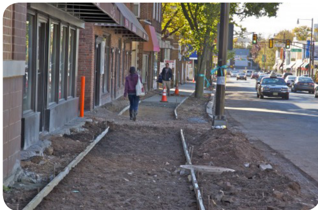
Sidewalk ready to be poured.

When homeowners and businesses are responsible for sidewalk maintenance, they might decide to hire a contractor, perform repairs on their own or have the city do the repair. Homeowner associations in some neighborhoods address right-of-way maintenance as a group to minimize the cost to individual members. In some areas, the city will subsidize sidewalk repairs for property owners. Local laws may also dictate whether or not a homeowner must hire a professional contractor to undertake sidewalk repair. Regardless of the approach for sidewalk maintenance, municipal inspectors should review and approve all repairs to guarantee that the improved sidewalk meets pedestrian access needs and the requirements of the ADA.