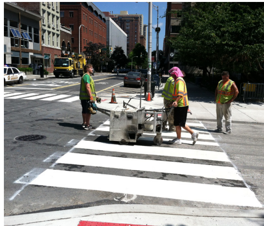
Installing high visibility crosswalks in Hoboken, NJ.

The plan should clearly specify the frequency of maintenance activities and how reported maintenance concerns will be addressed. The development of the plan should be coordinated between the Departments of Public Works, Engineering and Planning, the School District, and the agencies that have jurisdiction over the rights-of-way included within the school zone.