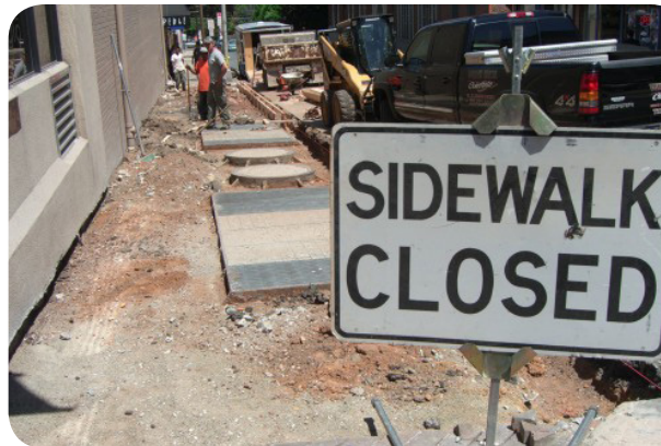
Sidewalk closed for repairs.

The statute also authorizes municipalities to adopt standards for sidewalk construction and to inspect sidewalks. The law is worded to allow municipalities to construct, repair and improve sidewalks along all highways, whether the highway is a municipal street or a county or state highway. The statute requires municipalities to secure the approval of the county prior to constructing a sidewalk along a county highway; there is no similar requirement in this statute to require a municipality to first secure approval from the state before constructing a sidewalk on a state highway. As written, the statute appears to consider a sidewalk to be an appropriate element of a street that may be constructed at municipal expense or by the abutting property owner.