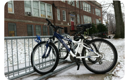
It is important to clear all bicycle and pedestrian related facilities of snow.

Nevertheless, it is recommended that residents clear the snow and ice from the sidewalks and paths along their property. If being a good neighbor is not incentive enough,