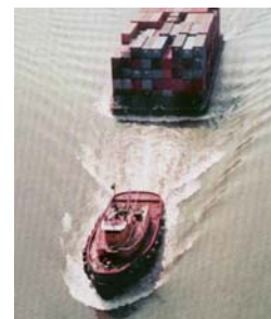
Feeder Barge Service

A South Jersey based PIDN (SJ-PIDN) service is currently being evaluated due to a combination of continued growth in regional consumer demand, the reliance on over-the-road truck haulage for inland transport, and increasing congestion along major interstates and local connector highways. If roadway or highway congestion is left unchecked throughout New Jersey, significant negative impacts to economic growth and regional air quality may result. A SJ-PIDN offers the potential to relieve some of the congestion along the NJ Turnpike corridor by increasing transportation's modal split for containers destined to inland locations through the use of a two-way feeder barge or line-haul rail service that directly connects the PONY&NJ with a South Jersey container facility. In addition, a successful feeder service could act as a catalyst for the creation of economic development opportunities through the combination of industrial, trade, service and logistic programs on a single site, where each business element benefits from the capabilities of other elements.