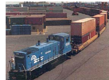
Line-Haul Rail Service