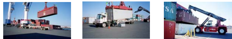
Potential PIDN Container Handling Process

The South Jersey Site Evaluation and Feasibility Study was conducted in cooperation with the following Steering Committee Members: DVRPC, NJDOT, DRPA, SJPC, SJTPO, PANY&NJ and other city, county and regional stakeholders.