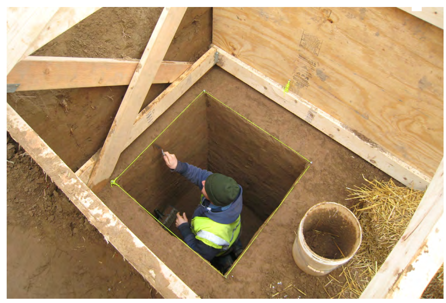
The excavations proceeded to a considerable depth in some locations, requiring protective shoring. Archaeologist Chris Connallon trowels clean a soil profile in Area 2 while standing some ten feet below the modern ground surface.

The 2,400 to 1,900 B.C. date range for the site's The bulk of the debitage consisted of black chert, leading primary period of occupation was supported by the archaeologists to conclude that the primary activity at the types of projectile points that were found. Of the 31 site involved the exploitation of river cobbles that would points recovered, several distinctive Late Archaic types have been available close by in the riverbank and riverbed. (Lamoka, Brewerton, Macpherson, Vosburg, Otter Creek, Chert cobbles are therefore thought to have been worked Kittatinny, Eshback, Poplar Island) were represented. A on-site into biface "preforms" (blanks), which would then smaller number of Terminal Archaic and Early Woodland point types (Dry Brook Orient Fishtail, Perkiomen) were finishing. This inference is based on the fact that, while found in Area 2 and may indicate a slightly later episode 44 bifaces or biface fragments were recovered, relatively of site use during the second millennium B.C.