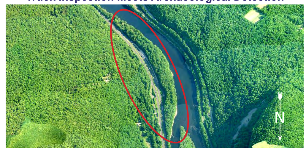
This view looks south and downstream along the Delaware River just below the Water Gap. The Route I-80 truck weigh station and prehistoric site 28Wa290 are located within the red oval.

The Route I-80 corridor is one of L the most heavily traveled east-west routes in the United States. Traffic heading east for New York City passes lengthwise through Pennsylvania and drops down into the Delaware Water Gap before crossing New Jersey and reaching the metropolitan area. Where better to check the weight of eastbound trucks than on the banks of the Delaware just downstream from the natural funnel of the Water Gap. Here in Knowlton Township, Warren County is the interstate pull-off known as the Route I-80 truck weigh station. Long bulging with vehicles and working at full capacity, this facility is currently under expansion by the New Jersey Department of Transportation.