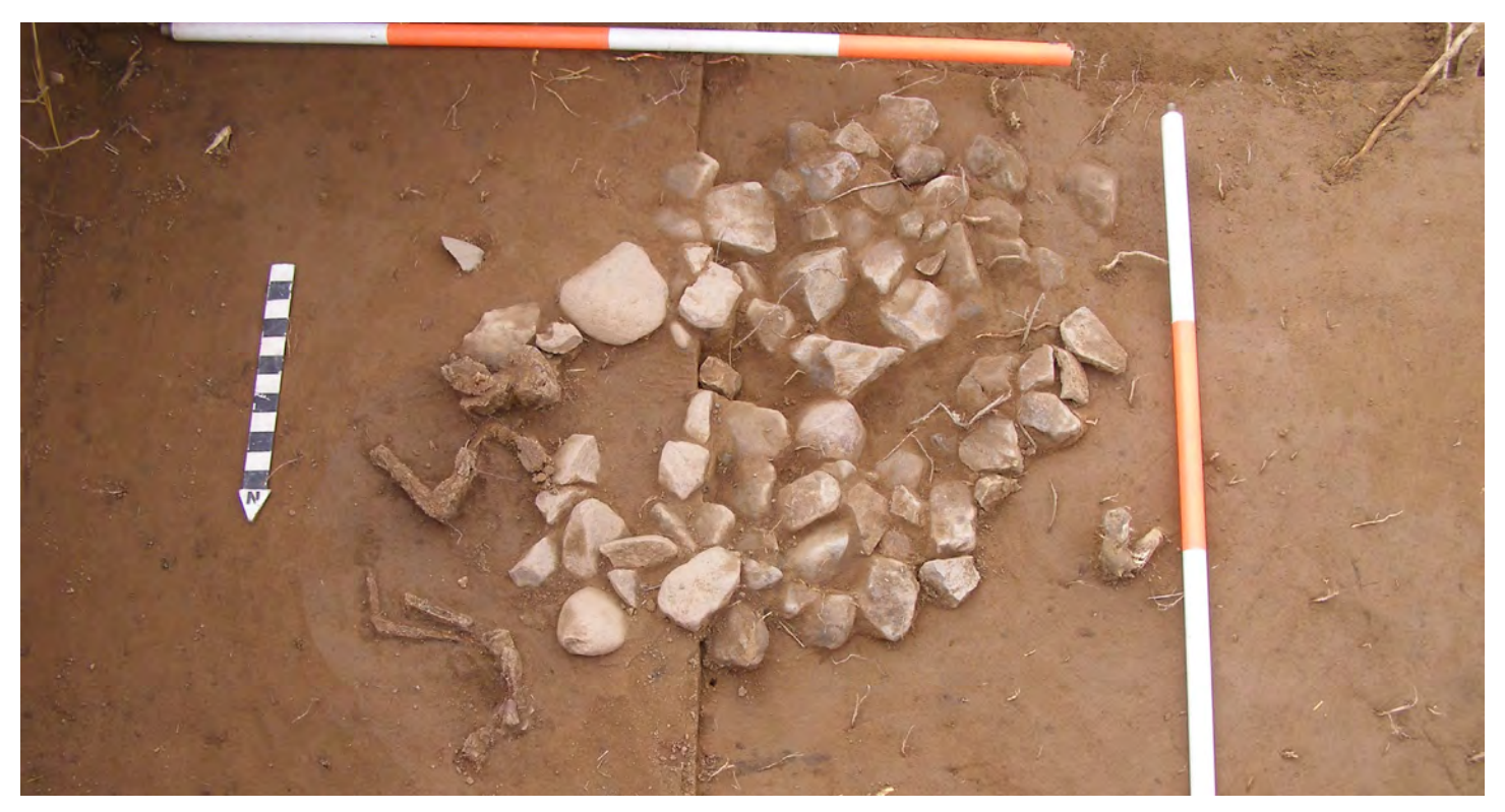
At the left of this view are the remains of a fox found above and adjacent to an unrelated cluster of hearth rock in Area 1.