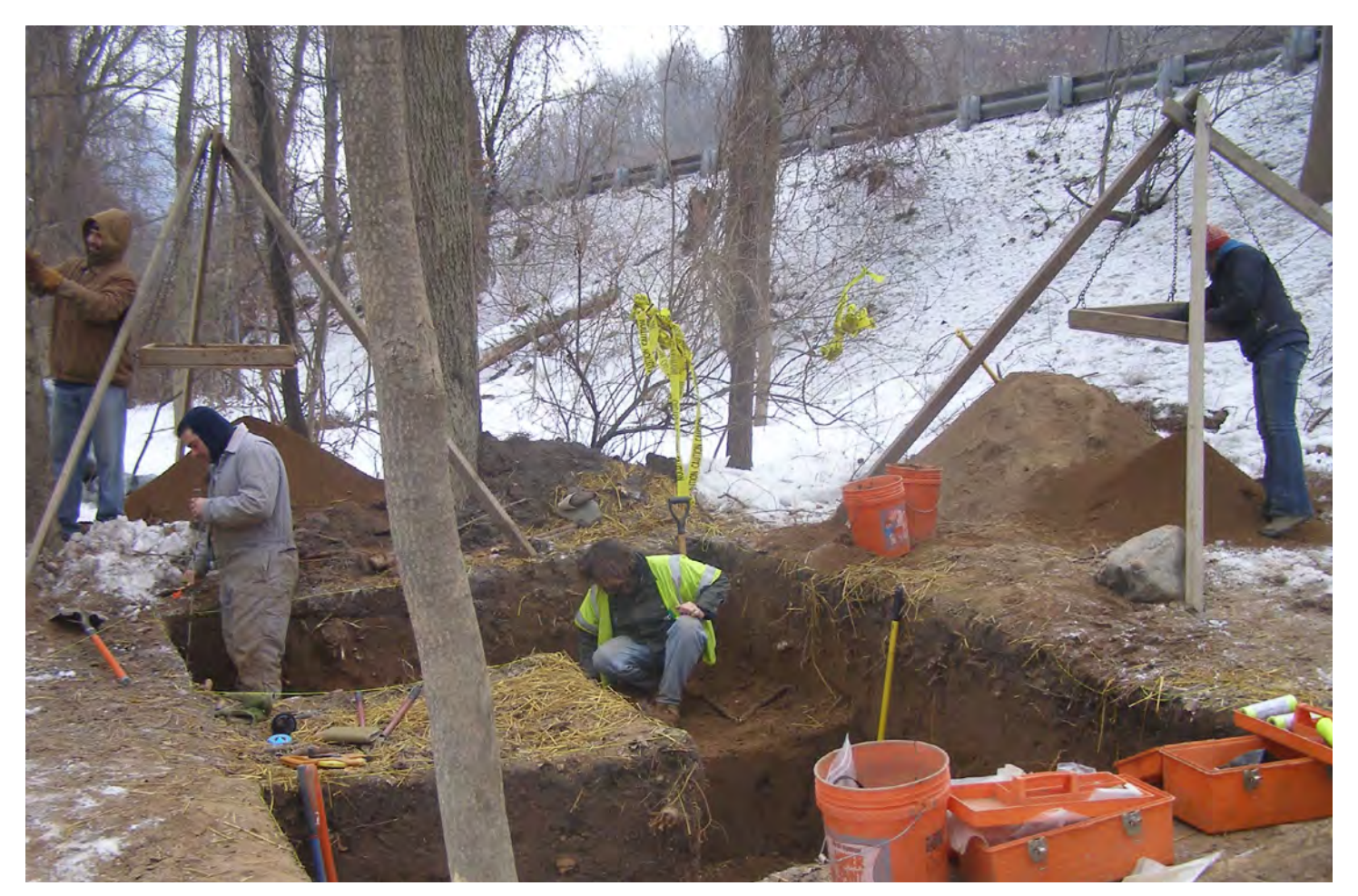
Midwinter excavation is in progress at Area 8 on the terrace directly below the weigh station. Archaeologists can be seen excavating five-foot-square units by hand, screening soils for artifacts, and documenting the location of critical finds

highway and river, extensive redesign of the weigh station expansion was not possible and NJDOT undertook to mitigate the project's effect on the archaeological remains through a program of data recovery excavation.