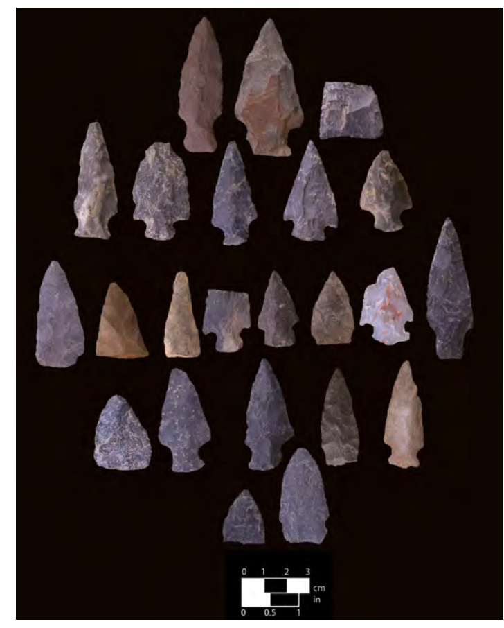
This selection of projectile points from prehistoric site 28Wa290 mostly comprises Late Archaic spear tips datable from circa 2,500 to 1,900 B.C.

As of the fall of 2011, the expanded weigh station is under construction. The archaeological work described here was restricted to those portions of prehistoric site 28Wa290 that were directly affected by the expansion project. Much evidence of Native American occupation still lies below ground in the immediately surrounding area (and probably also beneath the highway). Soils at least seven to eight feet below the present ground surface may contain artifacts and traces of occupation. The artifacts and documentation from the survey of 2004 and data recovery of 2008-09 are held by the New Jersey State Museum.