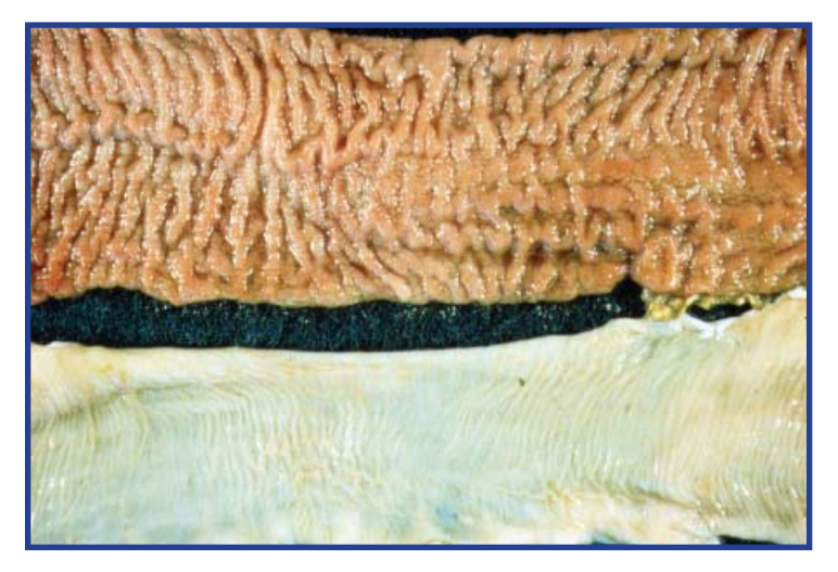
Top: Thickened intestinal mucosa caused by Johne's disease. Bottom: Thin, pliable, normal intestine

A: When an animal is infected with MAP , the bacteria reside in the last part of the small intestine—the ileum—and the intestinal lymph nodes. At some point, the infection progresses as bacteria multiply and take over more and more of the tissue. The goat's immune system responds to the bacteria with inflammation that thickens the intestinal wall and prevents it from absorbing nutrients. As a result, a goat in the clinically ill stage of Johne's disease in effect starves to death. At this stage the organism may also spread beyond the gastrointestinal tract, travelling in the blood to muscles or other major organs such as the liver or lungs.