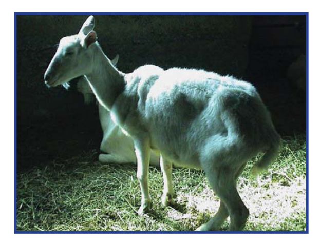
A goat showing symptoms of Johne's disease.

Since the signs of Johne's disease are similar to those for several other diseases—parasitism, dental disease,