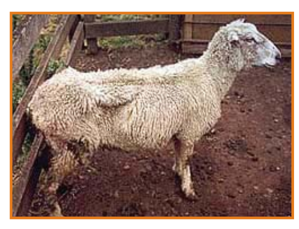
A sheep showing symptoms of Johne's disease.

Since the signs of Johne's disease are similar to those for several other diseases—parasitism, dental disease and caseous lymphadenitis (CLA), laboratory tests are needed to confirm a diagnosis.