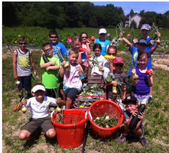
Students on a farm field trip at Cecil Creek Farm

Thank you to all six farms who applied for the 2019 Farmer Recognition Program. We believe it is important to highlight how vital farms are to Farm to School activities across the state. Without farms, there would be no Farm to School!