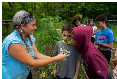
Curious Campers

YMCA Camp Mason in Hardwick, NJ has a beautiful garden. This summer their campers learned about vegetables and tasted some fresh produce straight from the garden. We would love to see more sponsors and sites take advantage of the summer abundance like Camp Mason.