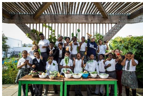
Happy student farmers

Seventeen schools applied for the 2018-2019 Jersey Fresh Farm to School Award but only one could be named Best in New Jersey. Please help us congratulate Philips Academy Charter School in Newark, NJ as the Best in NJ Farm to School Award Winner for 2018-2019.