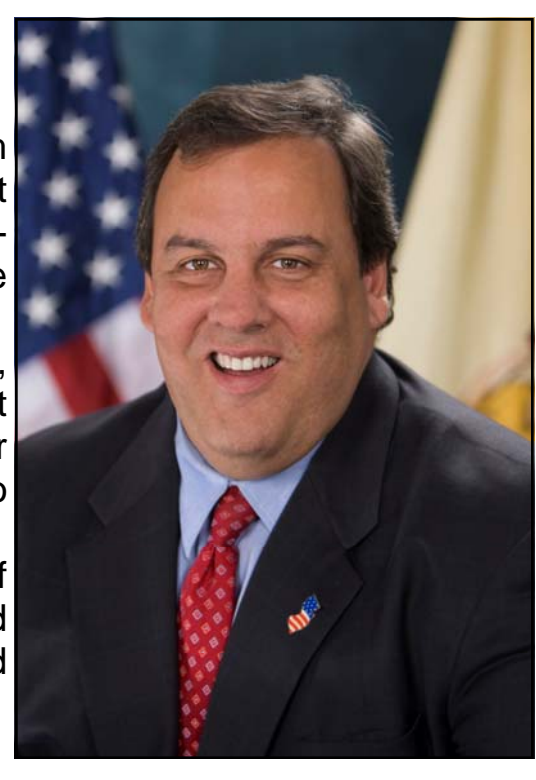
Chris Christie, New Jersey Governor

As I travel through New Jersey, I celebrate its geographic and cultural diversity. From cities to beaches, from mountains to farmland – all in the most densely populated state in the nation -we find a thriving agriculture that is close to where people live. This proximity provides many benefits to our residents, including access to the freshest, highest quality produce; farm visits to pick your own fruits and vegetables; facilities to watch world class equine events; nurseries filled with the widest variety of flowers, plants, trees and shrubs; and the best seafood caught or harvested anywhere.