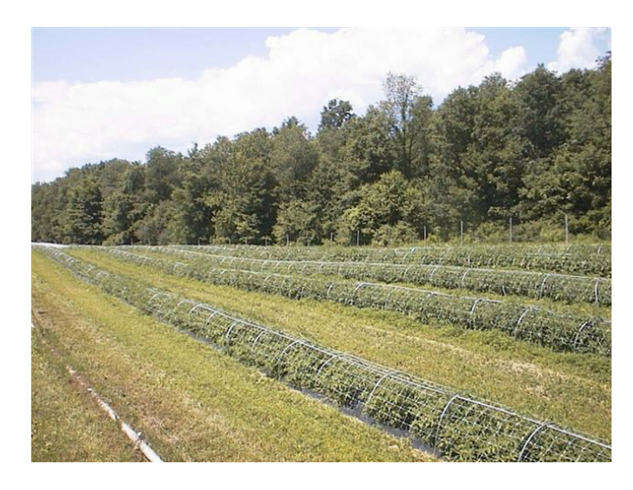
Tomatoes growing on Maple Farm

The most contentious issue stemmed from the decision to preserve the farm. Several family members were opposed to the idea for fear of losing the development