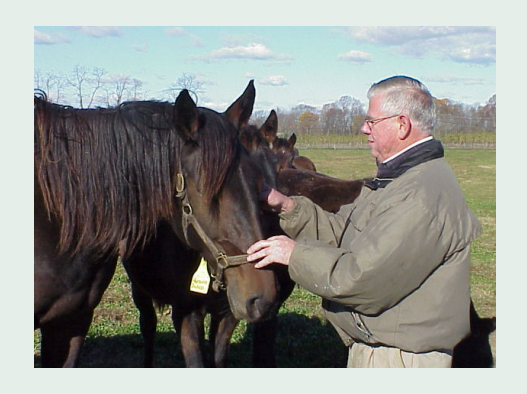
New Jersey State Agriculture Development Committee