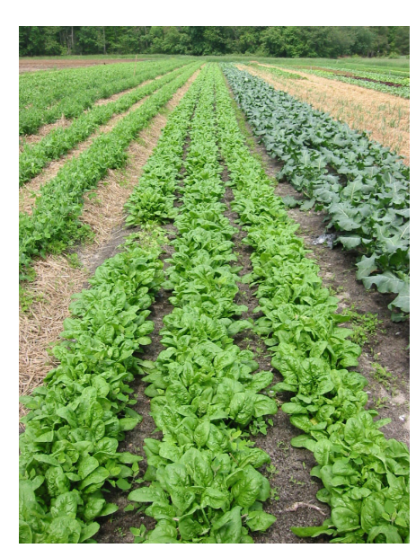
Cool-weather crops on the Muth Farm