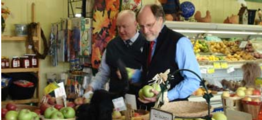
Governor Corzine and Agriculture Secretary Kuperus shop for apples at Robson Farm Market following the announcement that 150,000 acres of farmland have been preserved.