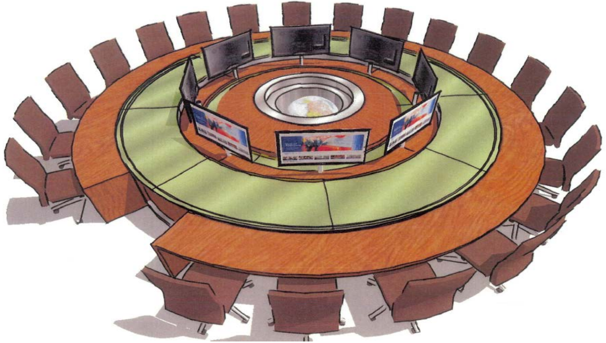
Illustration 2 Computer Depiction

(Gruskin Group Reference Material Dated June 3, 2013)