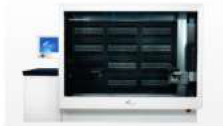
GeneXpert® Infinity Systems