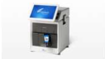
GeneXpert® Xpress System

Thank you for your order and for choosing Cepheid!