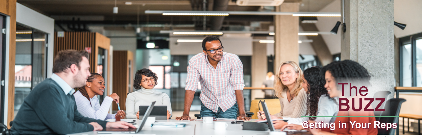
At CLIP, we strive to provide our participants with innovative and cutting-edge learning experiences. "The Buzz" features the latest training trends and noteworthy "buzz" about various professional developmental themes. Repetition is a cornerstone of cognitive development and a crucial factor in acquiring new professional skills. In this edition, we discuss how repetition not only refines execution but also builds confidence, reducing hesitation and enhancing performance under pressure.