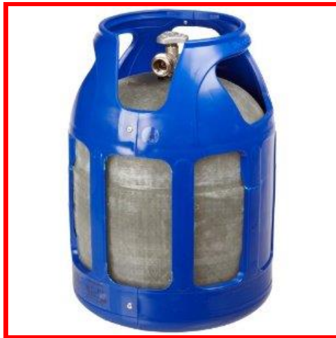
Example of a 20lb. cylinder that is affected by this recall.

1200 New Jersey Avenue, S.E., Washington, DC 20590.