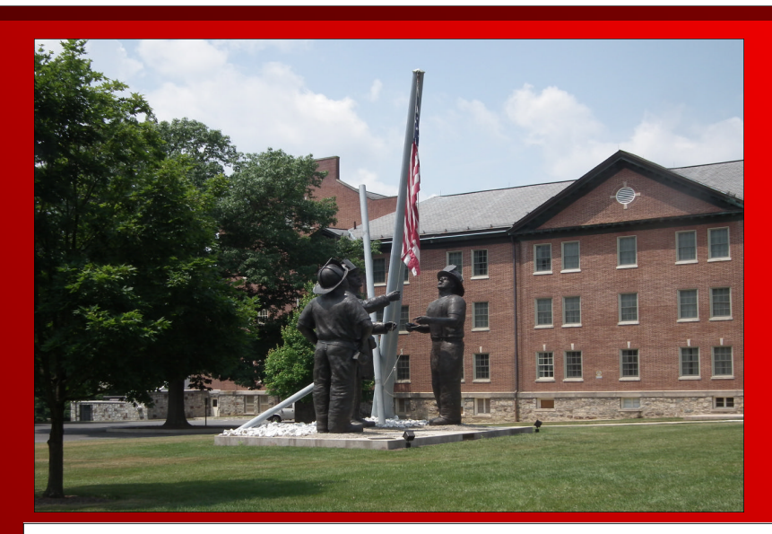
Not part of the National Fallen Firefighters Memorial but one commemorating 9-11 and its 10th anniversary this year.